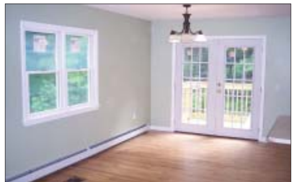
The kitchen now has new French doors that open to a small deck and the back yard.

Unfortunately, the seventh (Please turn to page 4)