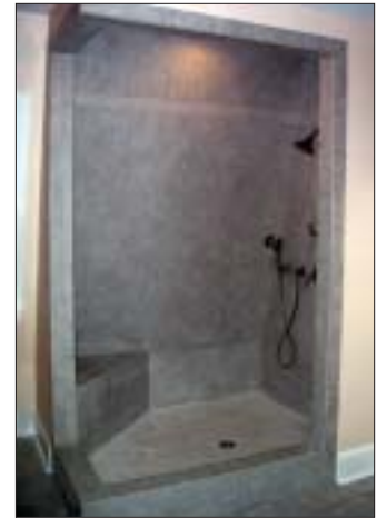
The new custom-tiled shower.

A sitting area occupied the other side of the third floor, and the Morrells wanted a bathroom with a custom-tile shower and walk-in closet between the bedroom and the sitting area. Webpo built the bathroom and closet, while PDR subcontractor Jerry Rideout did the tile work for the shower.