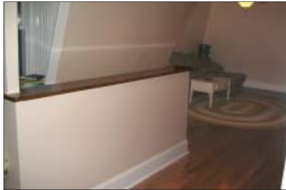
Wainscot on the window and the half-wall of stairway looking into sitting area.

pleted shortly after Halloween, the third floor had been transformed into a master suite with a bedroom, a sitting area, an office area, and a bathroom with a custom tile shower and walk-in closet.