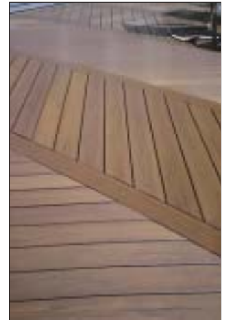
The Donovans' new deck (above) with herringbone pattern (right).