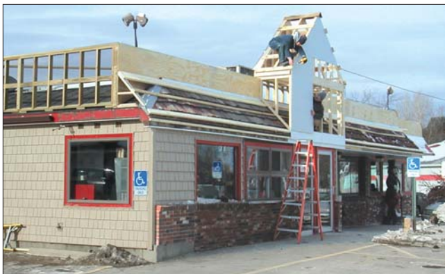
The Governor's Restaurant job in progress.