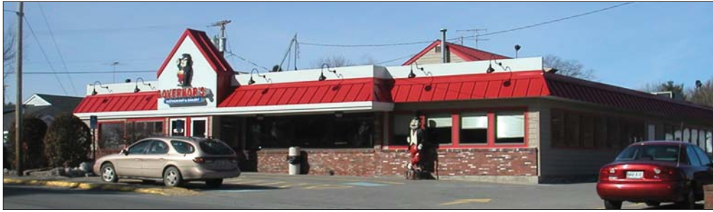
Governor's Restaurant in Old Town has a new look.