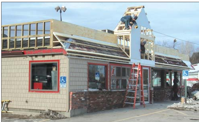
The Governor's Restaurant job in progress.